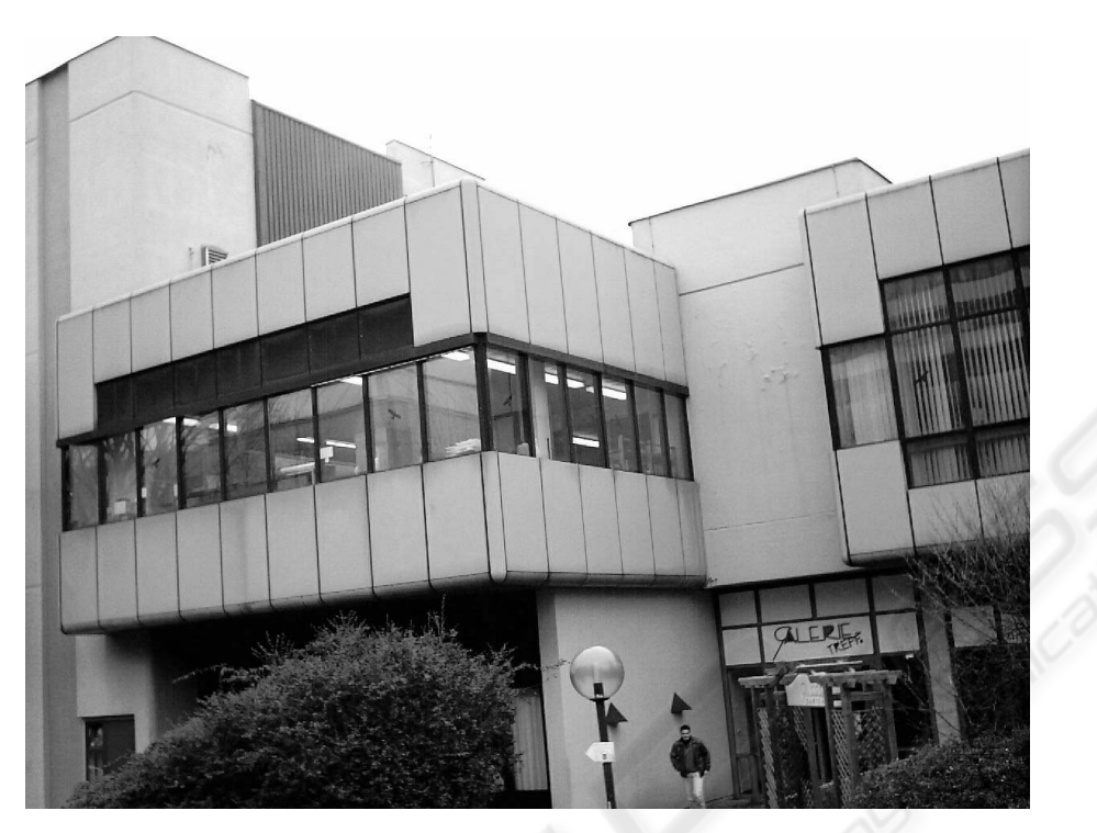
Figure 2: Example building inside the University of Dortmund, Germany.

be used to detect contradictions in the module states, and support engineers and modelling experts in correcting and modifying the system kernel. The initial rely value for new errors is kept low however, when modifying or extending the domain specific or scene specific database with new rules or semantic elements. When the same restrictions are detected again, the rely value of these rules will be evaluated and they will be considered as temporary. They will only get a continuous attribute, if their rely value ranges above a given limit which results from several analysis processes of the same occurrence. New tests may be performed within the different modules of the database, but only after precise validation by construction and modelling experts. Efficient and reliable databases are built up in this way for the domain specific and scene specific knowledge with optimal premises for analysis and synthesis within the whole modelling process. An example object is displayed in Fig. 2 and has been chosen to verify the proposed concept in the following paragraphs.