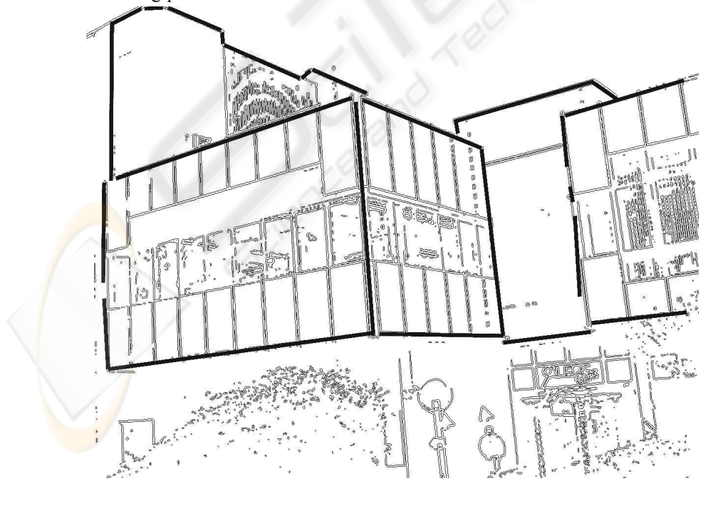
Figure 3: Result of the model primitive extraction after the knowledge refinement process

new recursive genetic algorithm RGA ,explained in section 5. The kernel of the concept is based on the consumption that the MEN (Mixed Expert System) is created step by step introducing additional knowledge in every new state such that the resulting knowledge base consists of a reliable part and a new one, which has to be proofed. The next section explains how the additional knowledge parts are linked and proofed to the existing knowledge base so that the complete structure forms a consistent platform for reliable decision strategies within an efficient modelling system. To improve and verify the automatically generated hypothesis a new analysis module is derived by applying supervised learning strategies which optimise and improve the final generation of the topologic structures. Within every reasoning decision it is the goal of the self learning system to add well fitting model parts and new knowledge elements which satisfy the object dependent criterions with the best evaluation. In addition the verification of the knowledge refinement process embedded in the learning module is performed by generating the physical model with the subsequent comparison to the reprojection in the original images. The evaluation result data can be transformed to comparable values as feedback of the recursive algorithm.