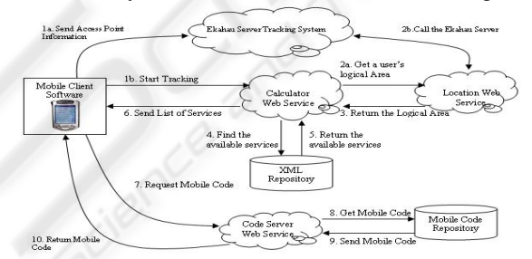
Fig. 1. System Architecture of MHS system

MHS uses the Microsoft .NET Compact Framework technology that natively supports XML Web service calls. Our system consists of users with handheld devices and a Web service that determines the location of a user, which are published via the system. This section gives a high-level description of these parts of the system, and how the parts interact. The system architecture is illustrated in Figure 1 below.