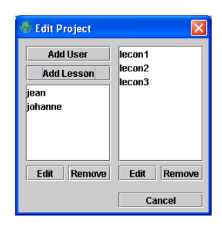
Figure 4: Project editing interface

The second component is a kind of Learning Management System, the platform in which online courses as well as accompanied files (teacher's photo, multimedia files) are assembled before the online dissemination.