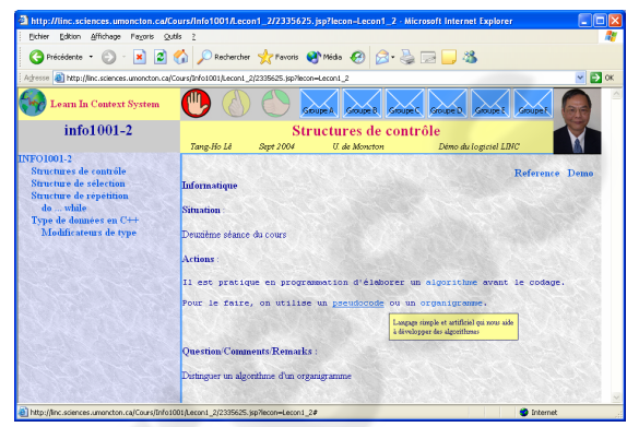
Figure 6: The LINC Learner's Interface

The forum for discussion between students can be opened by clicking on one of the six mailboxes icons labelled from "Group A" to "Group F". Figure 7 illustrates a window of exchanged messages from members of a group. We repeat that each mailbox's content is anchored to the corresponding topic of the lesson. Thus, we can lately trace the student's knowledge evolution.