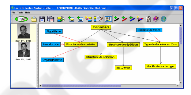
Figure 1: Example of a Knowledge Network

Another interesting functionality is the message board where designers can communicate with each other to accomplish their collaborative work by clicking on a display picture; if the display picture clicked represents the user oneself, she/he will then be able to send messages over the network. Otherwise, she/he can only read the messages.