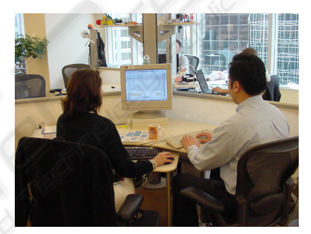
Figure 1: Pair Programming.

Project Y had several keen and experienced experts who built a solid foundation of test framework and set good examples for others to follow. With the supportive team culture, the automated tests typically would not be broken for longer than a day. These experts were the team champions, and they motivated everyone to adopt the practical application of test driven development.