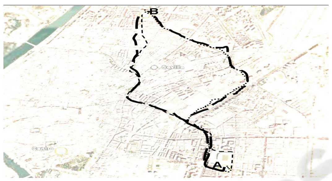
Figure 2: Four paths from A to B.

\begin{array}{l} 100*(Number\ of\ qi\in Scope(X_{A\cdot B}))\!/m\\ \ Hence,\ given\ X_{A\cdot B}\!=\!\{\ p_{0_{1}},p_{1_{1}},...,\ p_{n_{1}}\ \}\ ^{\wedge}\ Y\!=\!\{\ q_{0_{1}},q_{1_{1}},...,q_{m_{1}}\} \end{array}