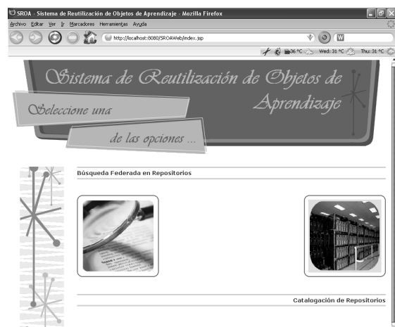
Figure 2: SROA system interface.

The second system (Figure 2), named SROA (Learning Object Reusability System), is part of another research project: PROFIT “FIT-350101-2005-4”, named “Publication and universal location of learning objects system”. The goals of this project are to analyze and design a prototype system to assemble courses by reuse existing content located in diverse remote repositories.