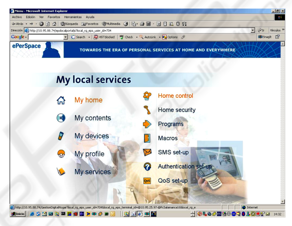
Figure 3: "Home Control" sub-menu.

Basically the automated control for the house domestic devices from the PC in web interface services of the Home Platform were evaluated. The user accessed the options from a list of services directly through the main page. The procedure to carry out the evaluation followed a prearranged scheme. Each subject was received in front of the house door, informed about the overall session and the services to be evaluated by means of questionnaires. The questionnaires were arranged in a labelled sequence, then submitted to the subject. About 60 questions over the total amount of 193 were answered by each subject in the section of the local services for the home (Figure 3).