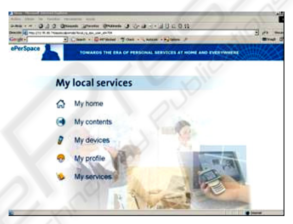
Figure 2: The home page to access the ePerSpace services at Home and Everywhere.

The home environment services evaluated by the users were selected from those that were set-up within the Home Platform Portal. An outlook of the services portal made available is shown in the following Figure 2.