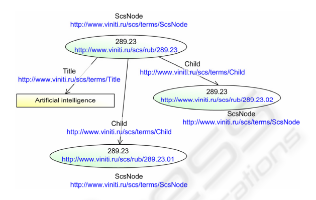
Figure 2: RDF representation graph for VINITI Classification Index rubric.

shown within the objects; types of objects are shown near them. Entities' and relations' URIs are shown. Use of URIs guarantees that, e. g. Child relation will be recognized as the parent-child relation used in VINITI Classification Index.