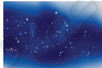
Figure 3: The words' constellation.

2- Second, there is a nominal reading that comes from the universe of words that have been selected from the text.