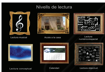
Figure 1: Reading paths.

The Diary of an Absence aims to be an example of intimate personal writing through something which has been put into words but which perhaps should have remained unsaid. In an exercise of visual structuration of hypertextual narrative (Koskimaa 1997), the text has been disposed spatially in a closed space, with rooms to walk through, just as we travel different routes when we go deeper into the intimate truth of the suffering narrator. We have chosen to use technology for a goal that is aesthetic, narrative, semiotic and hermeneutic. In this regard we must point out that here you will not find a range of the most advanced media as a technological exhibition without any other purpose than the mere display of resources, but rather a group of computer-based media in the service of an aesthetic digital product. Its fundamentally hypertextual nature evokes the most secret and intimate aspect of hypertext –something that becomes still more relevant when you bear in mind the element of confession, of self-confession—that is implicit in a private journal. At the same time