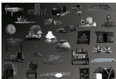
Figure 6: Reading through the objects.