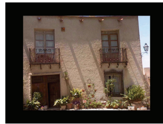
Figure 2: The house-scenario.

1- First, there is the exploratory immersion in the house-scenario that offers, through the rooms, words acting as passwords and points of access to the different days of the text. This is a way in which curiosity and the chance in our choices take us to words that act as a call for the hidden text to appear, the text to which they refer, to which in fact they belong, because this is where they come from.