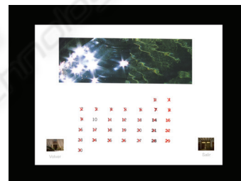
Figure 4: The numerical reading.

3- One can follow a numerical reading by looking at the 'treasure map' of the numbers allowing a chronological reading of the diary pages. Bearing in mind that each diary page corresponds to one day in a month, a third reading is also possible based on the texts that have been discovered/revealed in the linear order of the calendar. We must remember, however, that the correspondence between the word selected and the day of the month to which it refers will not be visible until the content of the word has been revealed.