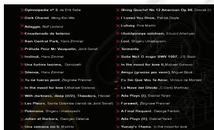
Figure 7: A musical reading.

In this context, we ask ourselves and our students: Is reading something that can be shared? Will everybody have read the same Diary if everybody's reading is necessarily different? Even one single person can read it differently on different occasions. To what extent will a linear reading of the Diary of an Absence , the reading that is most literary and least playful-exploratory, diverge from the reading that one can carry out on paper with the fragmented and random texts of the individual pages of a diary? Will the choice of music, of the landscape