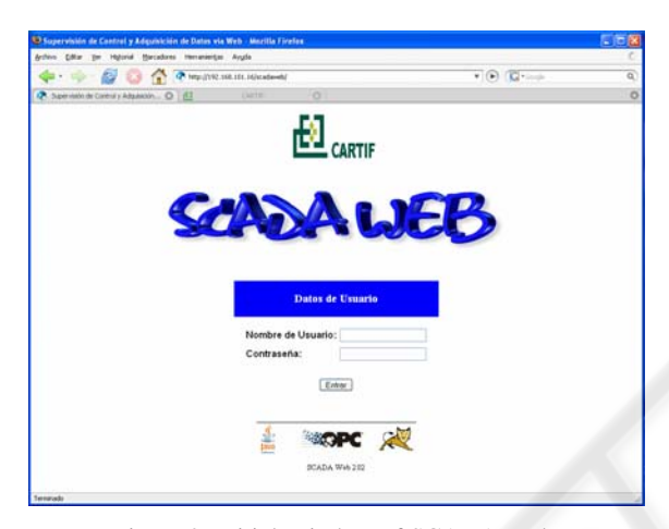
Figure 2: Initial Window of SCADA Web.

After previously stated requirements are fulfilled it is necessary to open a web browser window and to connect to the server where the SCADA Web application is installed. A similar window is showed in Figure 2.