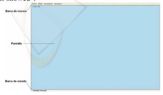
Figure 3: SCADA Web Application: "Constructor".

In the figure 3 an image of "Builder Application is showed".