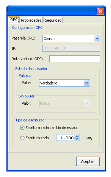
Figure 9: Dialogue window of a toggle.

Alarms. In the SCADA Web Application it is also allowed to configure alarms. It is possible the monitoring and recognition of alarms. Alarms are administered in the server. Because of this, the consistency of all alarms by users can be saved. In this way we can supervise remotly and simultaneously the process.