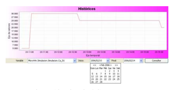
Figure 13: Historical Component.

Besides, is necessary to configure users that could use this SCADA system and the permission level of each one. Due to this and to the fact that each component has a permission level associated is possible to control the access as well as to adapt the SCADA system according to permission level of the authenticated user.