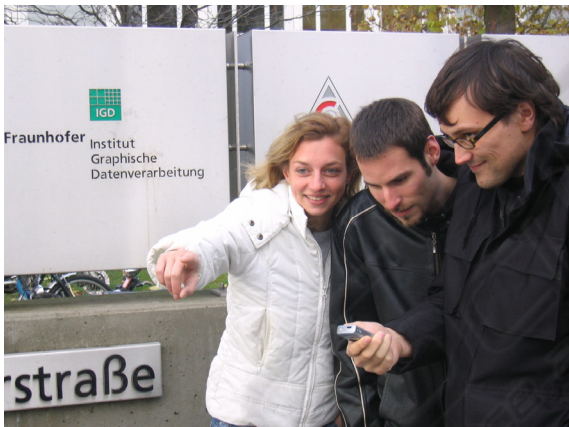
Figure 2: Students Playing “Mobile Chase”.

Exactly as in the classic archetype a team of players runs through town marking their route each time they change direction. A team of pursuers starts with a several-minute delay in order to track down the first group. Instead of using chalk arrows, in “Mobile Chase” the first team has to mark each shift in direction with a photo, which is then geo-coded using GPS and uploaded to the server by the cellular phone.