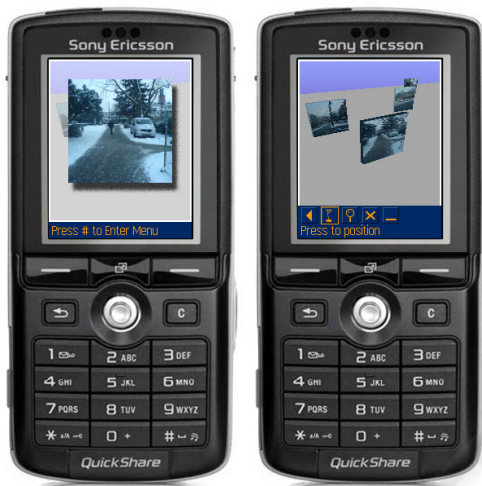
Figure 3: Zoomed view of the next Marker and a view of the 3D display of the playing field showing four Markers and the game menu.

to deduce information out of the playing field like the distance and the direction from one shown place to the next one. Technically the visualization of the markers was realized by using textured cuboids which were added to the 3D scene. By that it was possible, on the one side, to support the pursuing team in their task without, on the other side, providing the players' with too much information like in a regular street map where the additional information like the road names would have affected the complexity of the players' task.