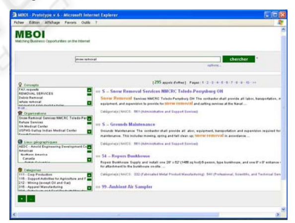
Figure 3: Querying in MBOI.

Figure 3 shows a query and its results in our system. Here the query snow removal was entered. The bottom right part of the screen displays the results, in the usual manner, i.e. call for tenders are listed by order of relevance. Each document has a small excerpt (from its filtered contents) where the query keywords are highlighted, as well as some extracted information (here, the classification codes). The boxes on the left represent information extracted from the top 100 result documents. Concepts are phrases extracted by the concept extraction tool, which represent the salient ideas of the document. Organizations, locations and categories are the named entities discussed above.