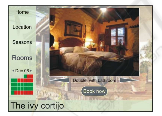
Figure 3: A personalized i-spot.

for everyday consumption, guides for cultivating, or simply indications to get to the nearest bar.