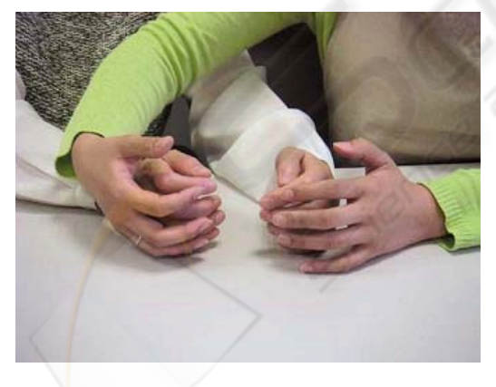
Figure 3: The finger Braille.

Namely from these fundamental characters of Linux system the fundamental ability of the EMR system can be expanded. The idea of the expanded EMR system involves the concept which has the character of expansion and the system idea which is able to change the organization of modern medical scene and educational scene of society and the base of recognition and senses of social system.