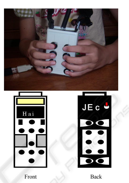
Figure 4: The new version of the "YUBITSUKYI".

Namely from these fundamental characters of Linux system the fundamental ability of the EMR system can be expanded. The idea of the expanded EMR system involves the concept which has the character of expansion and the system idea which is able to change the organization of modern medical scene and educational scene of society and the base of recognition and senses of social system.