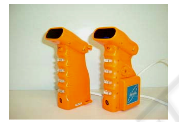
Figure 2: The "YUBITSUKYI".

Today, introduction of the EMR system is advanced all over the world. It is well known that the Linux system is an open source operating system and the characteristics of Linux system are advantageous and able to be expanded as the base of the EMR system, and at same time there is the expanding possibility of the functional ability of the EMR system. (Masahiro Aruga, S.Kato, et al, 2003), ( Masahiro Aruga,T.Takeda et al, 2006),( ( Masahiro Aruga,Shinu Ryu et al, 2006))