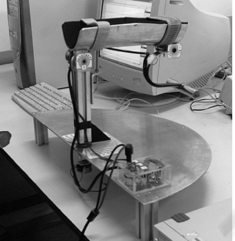
Figure 1: Device for arm support and joint angle monitoring.

Five men volunteers, ages between 18 and 21 years agreed to the test procedures, aiming to evaluate the contribution of biceps and triceps muscles during voluntary flexion and extension elbow movements, without load. For the accomplishment of the tests, a device for arm support and joint angle monitoring was used. The right arm were accommodated and fixed, allowing free elbow movement in only one plane and hindering other movements. For EMG signal acquisition, surface electrodes and the Powerlab PTB300 kit from ADInstrumets were used.