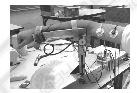
Figure 2: Arm position during movement at horizontal plane.

Figure 3 shows the signals acquired with one volunteer. From the top to the bottom, the first is the trigger signal for movement synchronism and speed control, joint angle position, biceps EMG signal, triceps EMG signal, rms of biceps EMG signal, rms of triceps EMG signal. And the columns represent each one of the repetitions of each of the three tests.