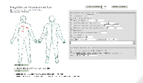
Figure 2: Procedure Registration in the EMR.

gence" of the system as a whole arises from the interactions among all the system's components. The interfaces are based on Web-related front-ends, querying or managing the data warehouse. Such an approach can provide decision support. A context dependent formalism has been used to specify the AIDA system incorporating facilities such as abstraction, encapsulation and hierarchy, in order to define the system components or agents; the socialization process, at the agent level and the multi-agent level, following other possible way of aggregation and cooperation; the coordination procedure at the agent level; and the global system behaviour. The data can also be used for educational and training purposes because maybe one of the unique cases can be identified and used in expert system like applications to advise practitioners ((Analide et al., 2006)). An screen view is shown in Figure 2.