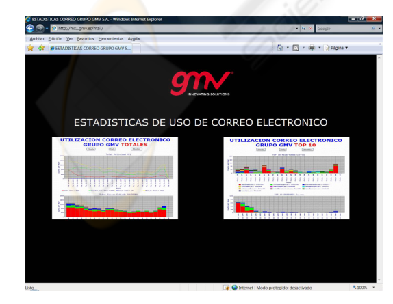
Figure 3: Home-page for the statistics of use for the e-mail services in GMV.

If we decide to see in detail the "total" part of the data we can see the statistics in a hourly, daily or monthly period, always showing the ratio between rejected and accepted mails.