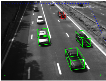
Figure 1: Result of the 3D points clustering : bounding boxes.