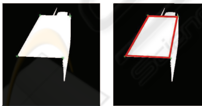
Figure 3: Delimitation of the roof.

vehicle. We can therefore limit the search of quadrilateral surfaces to zones behind 3m high bounding boxes (figure 2). A seed growing method is used to delimit the uniform gray level zone. This detector must be robust enough to recognize the roof of the truck in the segmented zone, which can include segmentation errors, such as side of the semi-trailer, cars that have the same gray level behind the truck, or road details (figure 3).