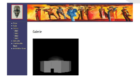
Figure 4: Metadata visualization (Entrance hall).