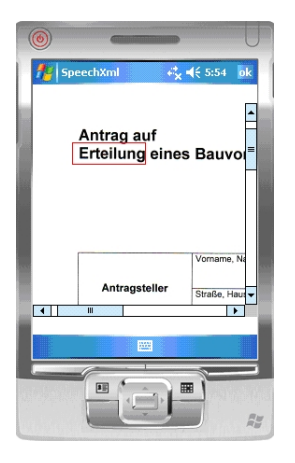
Figure 2: User Agent on a smart phone.

Another fact to consider is the lack of a keyboard on most mobile devices. Instead, we can use the microphone that mobile phone devices have always built-in. We will record the user's voice and perform speech recognition. The recognition process can be executed on the device itself or on the server that hosts the document repository. All these differences be-