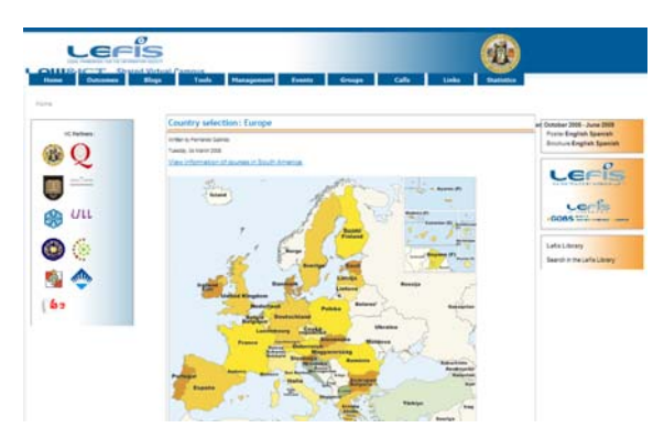
Figure 2: The LAW&ICT Shared Virtual Campus main Webpage.

be a meeting place and a resource centre for experts. This network will be the motor of the LEFIS Network.