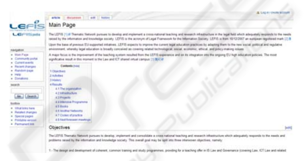
Figure 5: The LAW&ICT Encyclopaedia (LEFISpedia) main Webpage.

Another column of the LEFIS virtual campus is the online encyclopaedia. Online collaborative encyclopaedias follow the remarkable success of Wikipedia, and is being more a more envisioned and used in specialized contexts (v. g. Giustini, 2006) and, of course, legal education (Noveck, 2007).