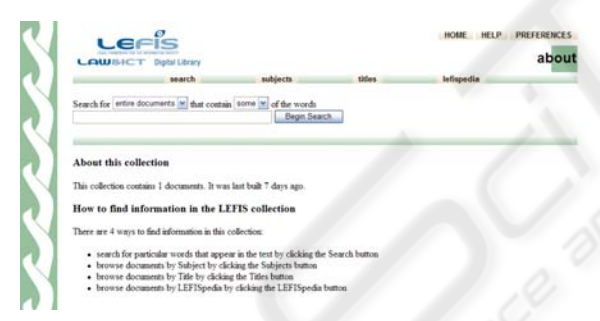
Figure 4: The LAW&ICT Digital Library main Webpage.

The LAW&ICT Digital Library aim is publishing and making available multimedia documents on LAW&ICT, ensuring all the bibliographic control features available in a library and also the immediate online availability of the materials.