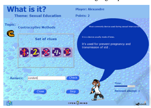
Figure 1: The player's module main interface.

"What is it?" has the differential in considering the players' profile, concerning the games presented in the previous section. Since the players have to subscribe themselves in the system before starting to use it, the new statements collected in the interaction can be related to their profile. Taking into account the players' profile collected is especially important for the culture sensitive approach necessary in developing applications for specific groups in a certain region and age, considering their context. In this case, the common sense knowledge can be filtered and the application's designer can consider only knowledge collected from a desired profile in order to contextualize it to the target group.