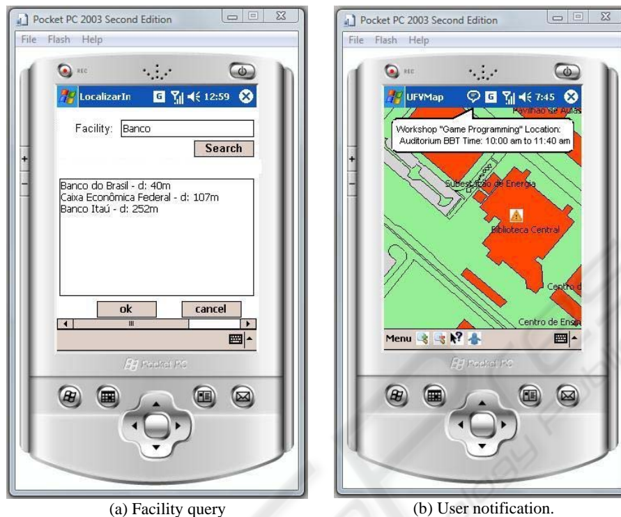
Fig. 3. (a) Query screens for facilities in the UFV-GeoMobile system. (b) Screen to notify the user the occurrence of any activity.

The mechanism to notify the Mobile-GIS users on the geographic location of any activity registered in their diaries was developed as a sensitive choice to the user's context. Initially, to have access to this feature the user must be identified in the system using a login and password. From this moment, every minute the operation GetEvent is called, as in Table 2. This operation receives as parameter, besides the login and password, the current time, which is obtained from the mobile device. This operation passes these parameters to the context management module which generates a SQL query (Table 2). This query returns all the user's recorded activities to start in 10 minutes, describing the activity in detail, initiation and completion time, name of the facility in which the activity will be performed and the coordinates of the building's center point where the facility is allocated. From this information, the Mobile GIS application displays a text box and indicates to the user the activity location through an icon, as in Figure 3-b.