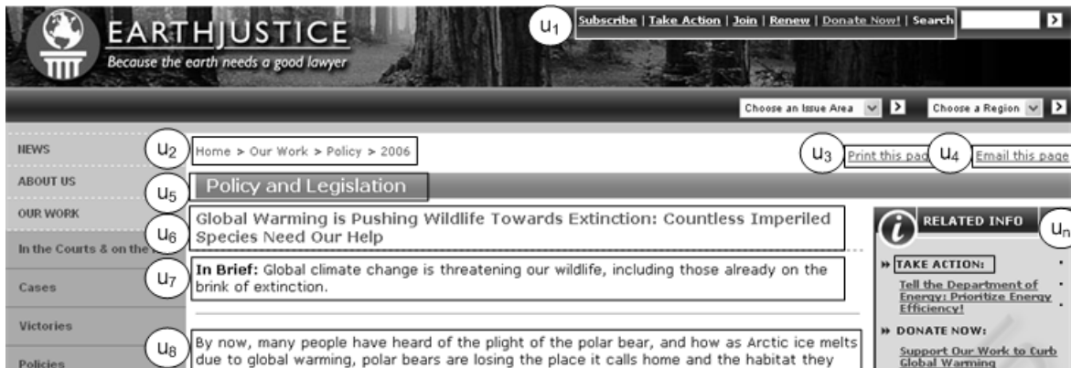
Figure 1: Part of an example HTML document.

related work on incremental parsing using machine learning (Collins and Roark, 2004). An application of such an approach is to automatically generate a table-of-contents for a book (Branavan et al. , 2007).