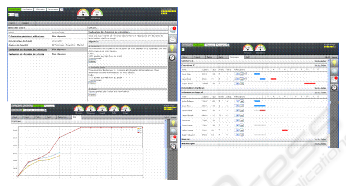
Figure 3: Screenshots of the Player's Interface: Decisions, Resources Planning and EVM Reporting (clockwise).

In academic usage, SimProjet has given very positive results, with increased interest and participation of students. Even if not formally measured, the feeling is that it allowed learners to much better understand the value and limitations of formal project management tools and techniques such as PERT, Gantt and EVM. It surely increased students awareness of the complexity of relational issues affecting a project, therefore making them acquire some ability in approaching the kind of situation they will meet in their future careers as projects workers. Experience seems to indicate that the theoretical knowledge level at the end of the course is the same that with the former course without the simulation (the results at the theoretical exams are similar). But it seems that the ability to apply the acquired knowledge has significantly improved. The limitations we saw so far stand in the deep motivation of each individual: the gap in knowledge acquisition between motivated and less-motivated students is probably even larger than in classical teaching methods.