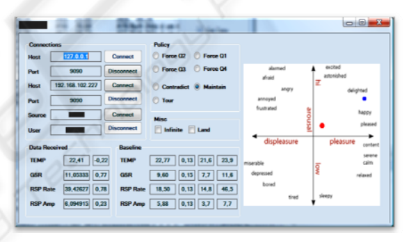
Figure 3: BioStories Running Application Screenshot.

Considering the mentioned normalization process, it is important to detail the already superficially mentioned calibration process. In spite of any given Cartesian point represents a normalized defined univocal continuous emotional state, it can be the result of an infinite number of biosignals conjugation.