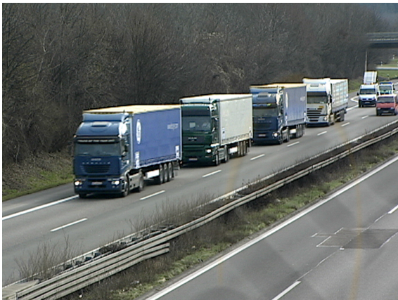
Figure 1: Test Run on German Motorways (March 2009).

The development and evaluation of the practical use of truck platoons is the objective of the project KONVOI, which was funded by German's Federal Ministry of Economics and Technology. The Project KONVOI is an interdisciplinary research project with partners of RWTH Aachen University, industry and public institutions, which ended after a duration of 49 months with test runs on German highways at the end of May 2009 (Figure 1). With the assistance of virtual and practical driving tests by using experimental vehicles and a truck driving simulator, the consequences and effects on the human-, the organization- and the technology-dimension have been analyzed (Henning et al., 2007).