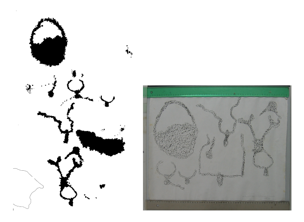
Figure 4: Petroglyph identified by id. ZVIIGIIR7: de Lumley team's relief (left; private collection owned by Adevrepam) and Bicknell's relief (right; private collection owned by University of Genoa).