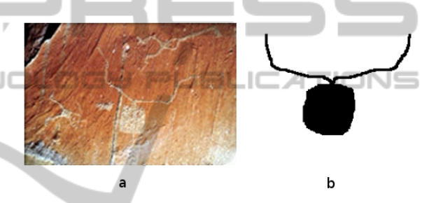
Figure 6: Picture (from http://www.cg06.fr/cms/annexes/ merveilles/w_musee_merveilles/) and sketch of an petroglyph.

The Classification Agent will return a ranked list of multimedia content according to tag similarity criteria that can be different depending on users's needs (which can be defined using specific ontology-driven parameters). Also, users can decide to browse the repository according to the structure of the knowledge base, using specific ontology-driven paths and constraints, similarly to the approach presented in (Vrochidis et al., 2008).