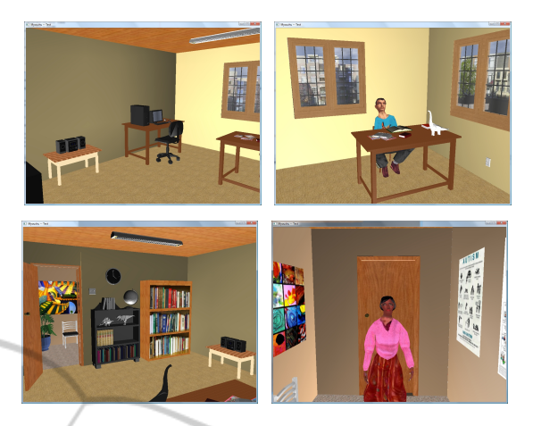
Figure 2: Demonstration program screenshots.

To illustrate one of the sensory integration problems which people with AS normally have, a couple of scenarios were built into the demonstration. The first one is a radio inside the office which plays