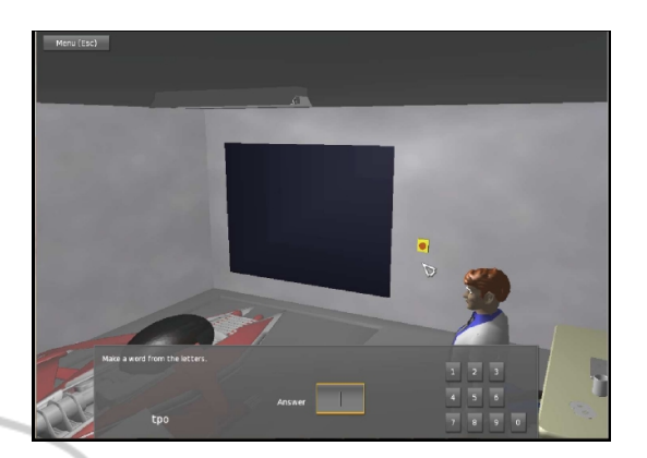
Figure 3: Educational game screenshot.

We are currently in the process of implementing the ECA in an educational game. This is a simple game reinforcing arithmetic and grammar skills. It is currently in use in a local school for children with learning disabilities, but without any ECA. In previous experiments, we noted that children with AS prefer not to have any help from human teaching assistants when playing the game. However, this sometimes caused frustration, when they could not find a