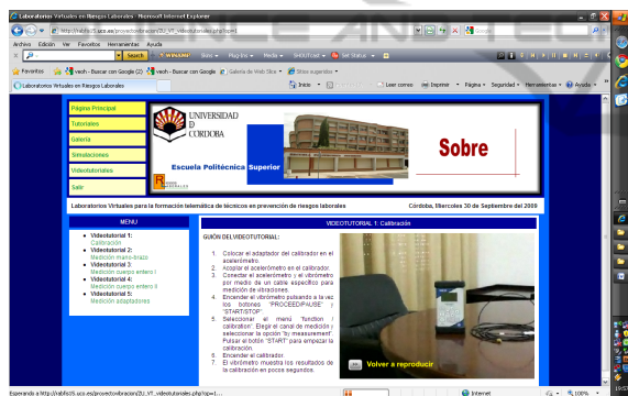
Figure 3: Video-tutorials.

Some videos are used for providing complementary information on certain aspects included in other modules of the application (Figure 3).