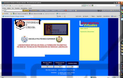
Figure 2: First frame of the virtual laboratories on work-related noise and vibration portal.

In the portal developed it is aimed to concentrate in one single software all the aspects necessary for a specialist in the prevention of work-related risks: noise and vibrations (Figure 2).