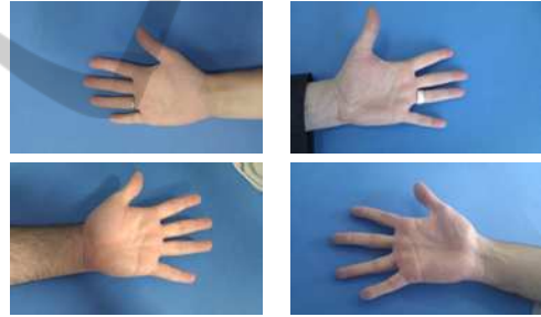
Figure 1: Samples of first database, with blue-coloured background. Synthetic database is based on this database, considering different backgrounds. In addition, the segmentation result of this database, will be considered as ground truth in a posterior evaluation.

Initially, hands were taken with a blue-coloured background, so that hand can be easily extracted, being this prior segmentation result considered as ground-truth for posterior segmentation evaluation. This database contains a total of 120 individuals, with their both hands and 20 acquisitions per hand. Some acquisition examples of this database can be seen in Figure 1.