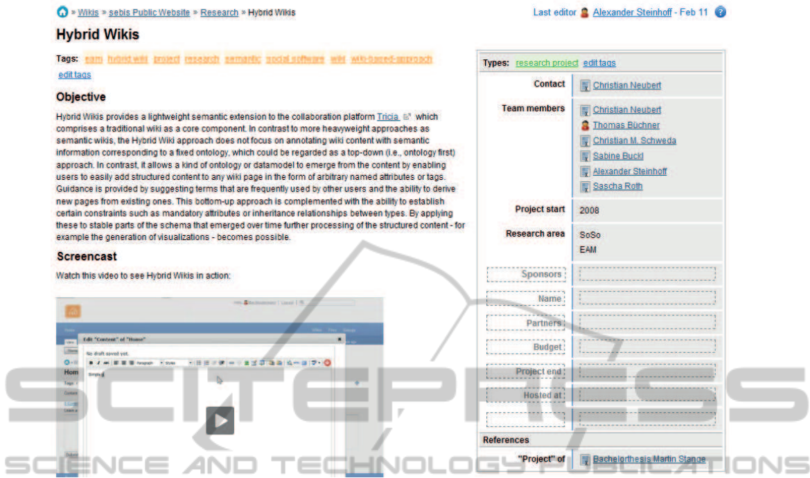
Figure 1: Type tags and attributes in the context of a wiki page.

wiki pages by stating that the tagged page describes an individual instance of the respective type – in contrast to vaguely relating it to a broad topic.