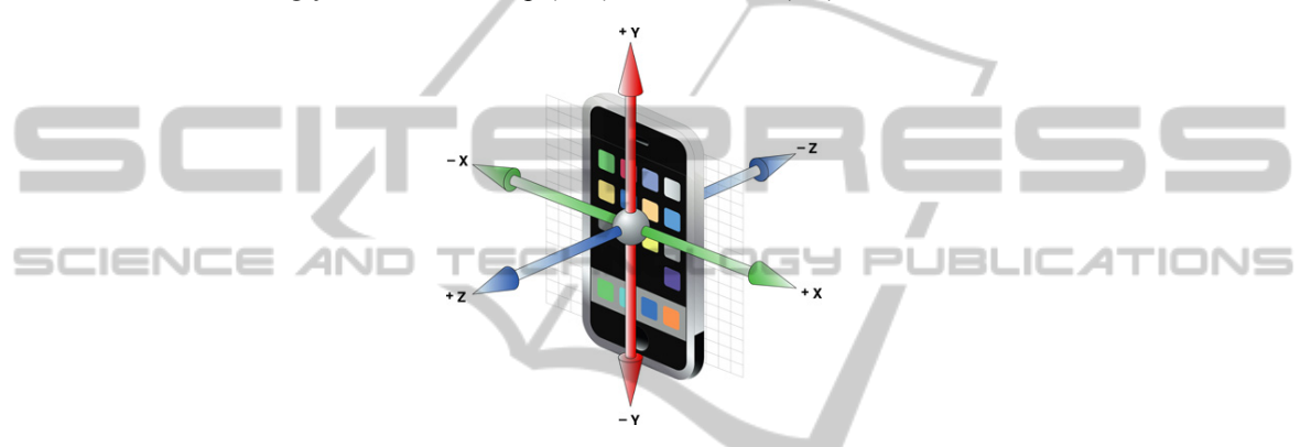
Fig. 1. The iPhone accelerometer axes.

• Z = Face up/face down. face up (-0.5) or face down (0.5).