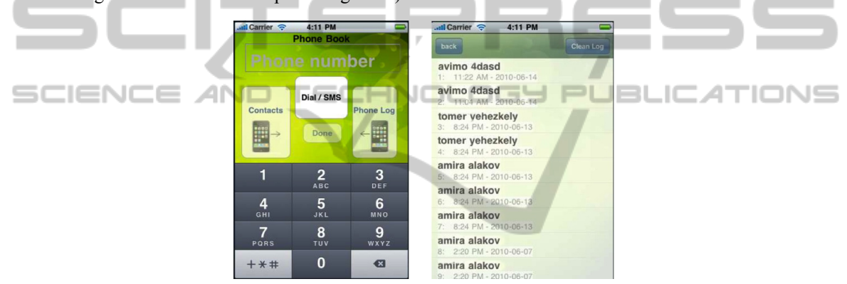
Fig. 2. The home screen: tilting right from the main screen brings to the phone log (coarse scrolling). The phone log list is scrollable by tilting up and down (fine scrolling) while left/right tilting selects and dial the current selection.

2. Coarse scrolling, or scroll and select: when less than three items are shown, the current, the next and previous (see Figure 2). In this case the gesture unambiguously selects the current, next or previous item. For example, the application contains several screens virtually ordered that can be accessed by tilting right (next screen) or left (previous screen). On each screen, a preview icon indicates the adjacent screens (see figure 1 the contacts and phone log icons).