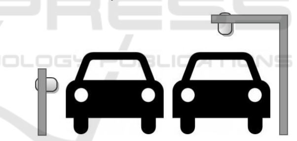
Figure 4: Sideway and over-road ultrasonic sensor implementation and detection.

Ultrasonic sensors can be also divided in two groups active and passive. Passive are not very accurate on high-intense traffic areas. That's why they are not widely-accepted. On the other hand active sensors count at greater precision. They emit their own sound wave which reflects form vehicle's surface