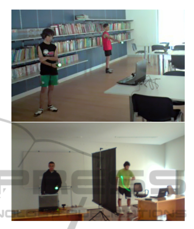
Figure 3: Msquash - user tests with two main groups.

The main positive aspects referred by users about the game were the fact that it promotes the physical exercise and also the interaction method used (i.e. the