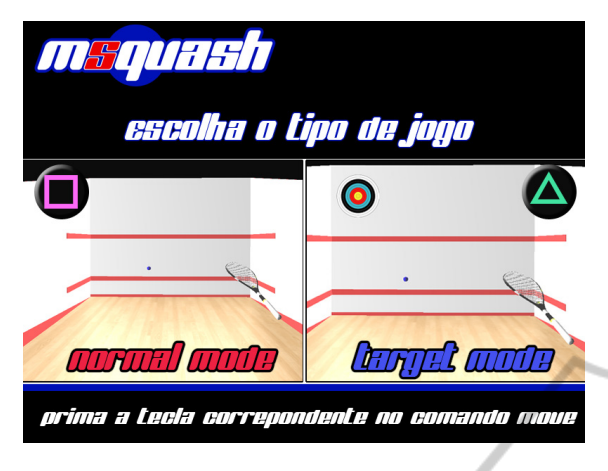
Figure 1: Msquash - the two modes available.

that the virtual environment offered enough realism to initiate natural gestures, i.e. that gestures did not differ between the real and virtual environment.