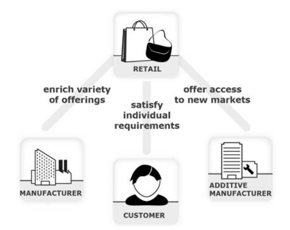
Figure 3: Values for involved parties.

The retail ties in basic value creation activities of other parties – namely the manufacturer of the shoe, the additive manufacturing provider and the customer. The individual benefits of these actors depend on the chosen operator model. It also impacts questions on copyright and data ownership.