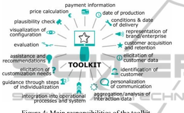
Figure 4: Main responsibilities of the toolkit.

Moreover, the toolkit ties in the data of all parties involved. This requires an integration of enterprise specific applications, e.g. ERP- and CRM-systems. The integration of social web and communities can raise additional value. Depending on the product category and the customization aim it could also help to connect the toolkit to online databases of 3Dmodels available for download.