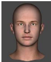
Figure 1: A close-up view of the pedagogical agent.

While limiting its functions, we aimed to design agent's appearance to be humanlike, to open up the potential to equip it with subtle human behaviours. The agent was developed as three-dimensional character using Face Robot®, and photorealistic textures were used to enhance graphical quality (see figure 1). Although the agent is capable of behaviours such as blinking, eye movement, and complex facial expression, only lip movement was applied for this experiment. The agent's lip movement was synchronized to pre-recorded voice using viseme method, and was done semi-automatically by Face Robot®.