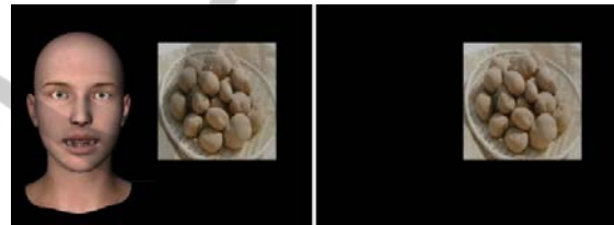
Figure 2: The participants learned from two conditions. In Ag condition (left) pedagogical agent was visible, and in no-Ag condition (right) it was not.

For learning phase, Ag condition and no-Ag condition were provided (see figure2). After learning under one condition, each participant learned under another condition without taking any break. To assess order effect on which condition comes first, order of conditions was counter balanced. Fifteen words were presented for each condition, total of thirty words. A photo was displayed, and a word describing the photo was presented by voice output, first Japanese then Korean. Each word was read out twice. Every word was a noun, consisting of less than five syllables (for both Japanese and Korean). Words were presented in random order.