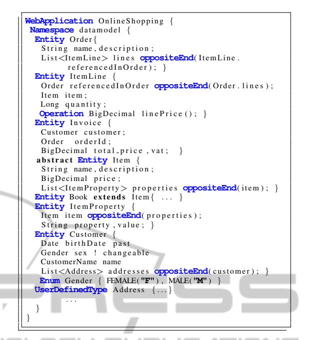
Figure 2: An excerpt of the DSL describing the information model.

In order to support the approach, a prototypical MDE tool was developed. The core layer of our generation environment is based on the Eclipse Modeling Platform including the Xtext framework, needed to develop the DSL Editors, and the Xpand framework, used to drive the generation tasks. On top of it, the code generation layer contains the Xpand Template manager component. It is responsible of applying templates on the user models in order to generate the needed resources. During this step, several resource-specific generators are used. The IDE integration layer is comprised of four DSL editors (one for each metamodel). They are built using the Xtext framework and integrated into the tool thus allowing the developer to model the application and to start the generation process. The platform also supports the reconciliation of changed artifacts with respect to the models changes.