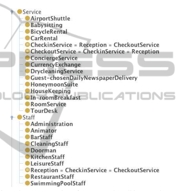
Figure 2: Representation of Service and Staff in Hontology.

sented as concepts in Hontology, e.g. with Balcony and with Sea View.