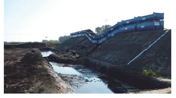
Figure 3: Dike breach of macro stability experiment.

For each experiment a dike is furnished with insitu intra-dike and extra-dike sensors. From these sensors dedicated short-distance communication lines run to small communication hubs, where the data is aggregated and transferred onto other longerdistance communication lines. This data is then