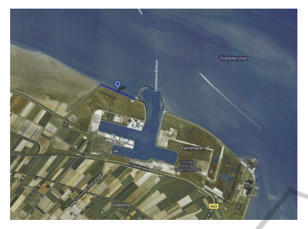
Figure 4: Location of Livedike Eemshaven (blue line). Background image Google Earth (Kruiver, 2010).

Based on a successful first year of this trail, several other "livedike" locations have been developed. Within the Netherlands: Stammerdijk, Vechtkade. Vlaardingse kade (see also 2010 www.Livedijk.nl). Since also several international dikes are being monitored, i.e. in Australia (Brisbane) and United Kingdom (Boston) (see also www.urbanflood.eu).