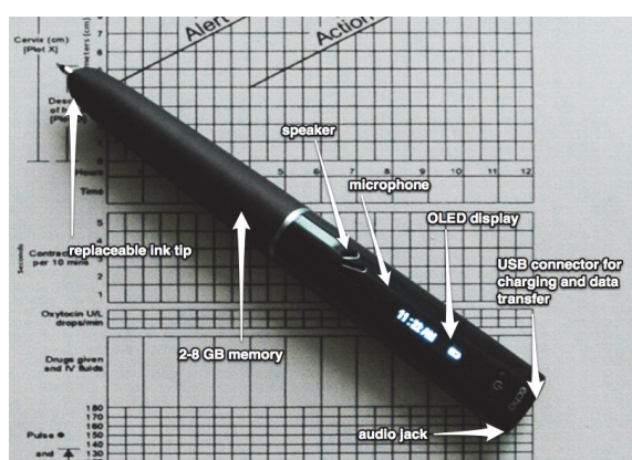
Figure 2: The digital pen used in the PartoPen system is depicted. The speaker, microphone, OLED display, USB connector, audio jack, memory storage, and replaceable ink tip are identified.

The PartoPen provides partograph training instructions, task-oriented reminders, and context-specific audio feedback in real time. Tapping the pen in different areas on the partograph form provides audio instructions taken directly from the WHO partograph manual, which reinforces birth attendant training. The pen detects abnormal labor progression by analyzing data entered on the partograph form, and provides audio and text-based feedback to encourage birth-attendants to take appropriate action.