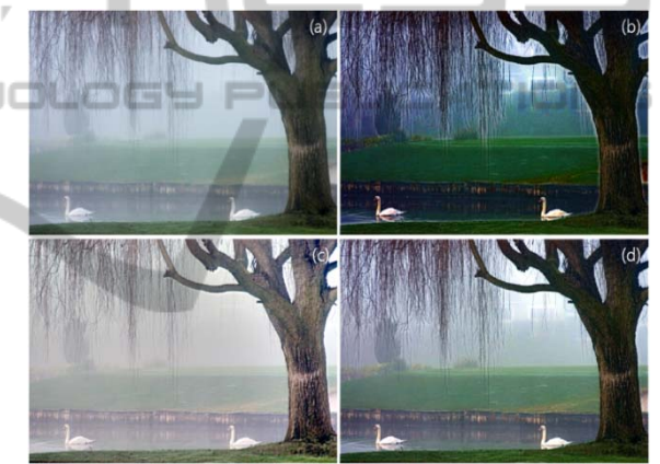
Figure 4: Visual comparison results. (a) input image, (b) dehazing, (c) retinex, and (d) the proposed method.

proposed method. Our proposed method achieved better visibility in the region of the tree and the boundary of the lake while revealing the building covered by a dense fog in background like (b). Meanwhile the retinex has no effect on removing dense haze at all in this image.