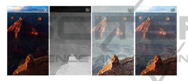
Figure 2: From left to right, dehazing without postprocessing, transmission, retinex, and the final result of combining (a) and (c) using (b).

where \alpha is the combining weight. In our experiment, we usually get visually better results with \alpha =0.8 for higher weight to the dehazing.