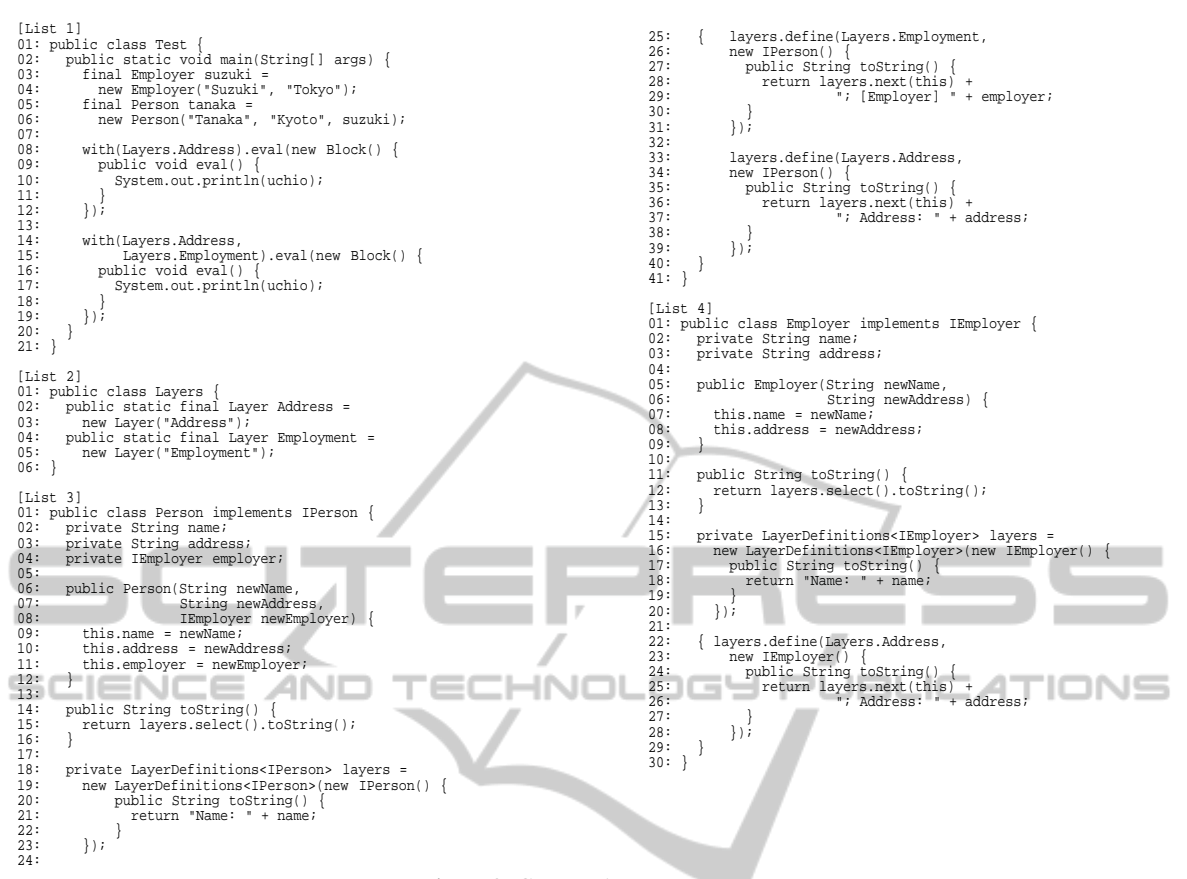
Figure 3: ContextJ* Program.

ployer. The message content changes according to the belonging context. In Figure 1, there is one base view and two layer views: Address and Employment. In Address layer, a layered method toString is called to display an address. In Employment layer, another layered method toString is called to display an employer's profile. In Figure 2, first, this example system can enter Address layer. Next, the system can enter Employment layer or exit from Address layer. We can easily understand system behavior by composing views according to context transitions. The following is the execution result. The same print statement behaves differently according to the context.