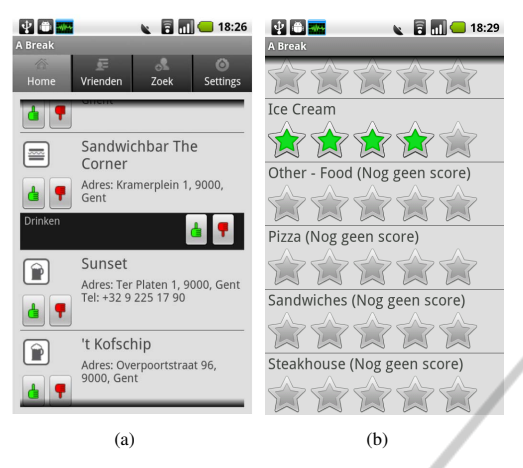
Figure 2: Screenshots of the mobile application, showing the list of recommended information items (a) and the possibility to provide explicit feedback (b).

screenshots of the user interface of the mobile application and illustrates the possibility to provide feedback. The popularity model collects feedback information from all users to discover general relations between a context and an information category. The result of this model is a set of triplets (context, category, score) in which the score estimates the probability that users are generally interested in a category, given the specified context. The more users and the more often these users have provided positive/negative feedback on a content item of a specific category in a specific context, the higher/lower the score.