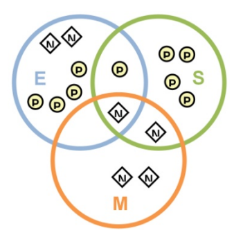
Figure 3: Distribution of new functionalities (N) and precisions (P) common or specific to each profile (E = Engineer, S = Stylist, M = Marketer).

As shown in Figure 3 concerning the six new functionalities (N), we observe that: