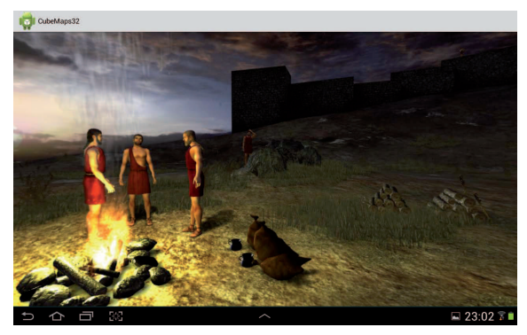
Figure 3: A 3D view of the Greek camp at Thermopylae.

screens or projection boards available in the reenactment room to display the visualisation of the scenario of the battle, along with video footage that may serve to illustrate what is going on, and even pictures or textual comments coming from the reenactors' devices. If available, loudspeakers will play accompaniment music and sound effects for further immersion. These features may enhance the educational aspect too, as proved in (Fassbender et al., 2012).