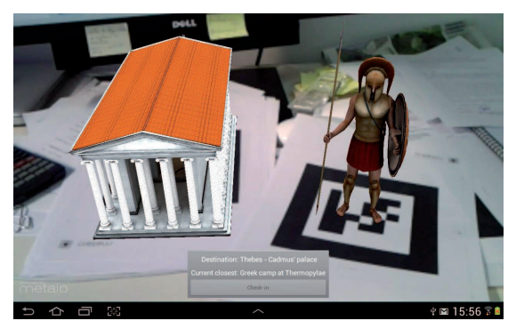
Figure 2: Displaying 3D models over 2D codes.

screens or projection boards available in the reenactment room to display the visualisation of the scenario of the battle, along with video footage that may serve to illustrate what is going on, and even pictures or textual comments coming from the reenactors' devices. If available, loudspeakers will play accompaniment music and sound effects for further immersion. These features may enhance the educational aspect too, as proved in (Fassbender et al., 2012).