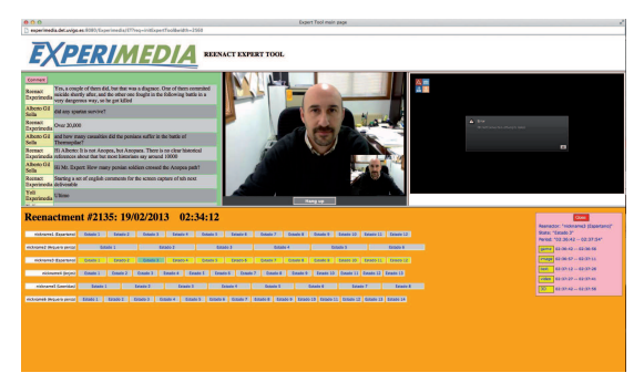
Figure 4: A snapshot of the expert's interface.

will be driven by one expert, who may be physically present at the projection room or appearing on the screen from a remote location. The expert will rely on a record of the movements and actions of each participant during the reenactment. Combining this record with the script of the battle, the expert will be able to identify specific situations lived by the reenactors that could serve to explain important facts about the course of the fights (e.g. to illustrate the technological superiority of one of the opponents, the war tactics employed, etc).