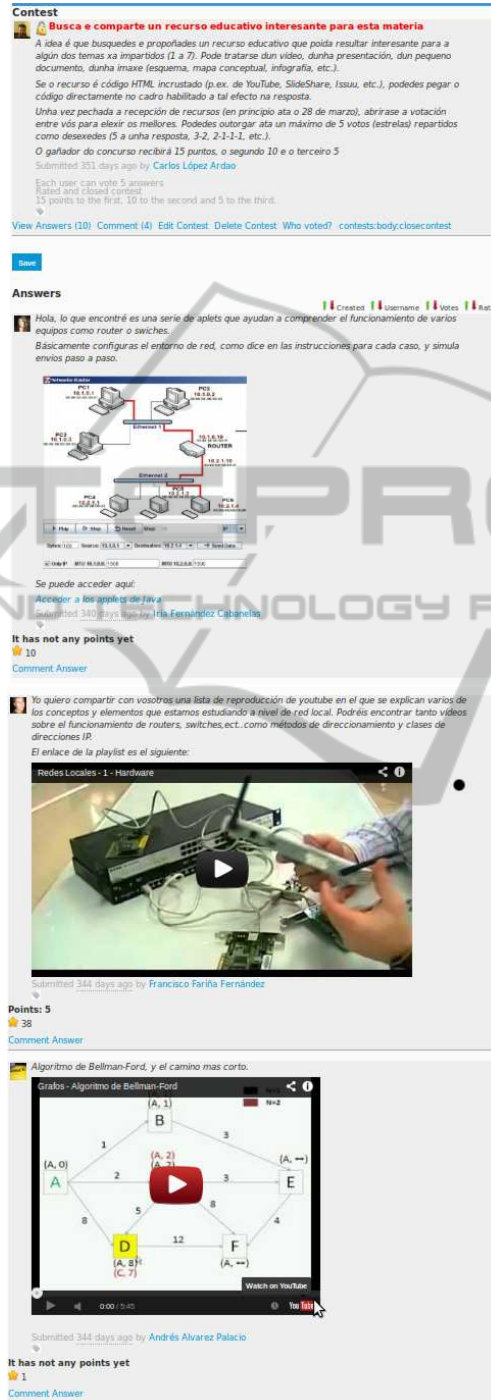
Fig. 2. View of the challenge module.