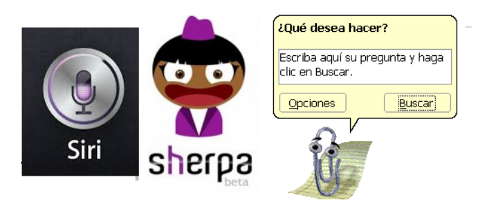
Fig. 1. Examples of Personal Assistants.

activities from a specific category anchored in the official curriculum for infantile education [7]. The process is straightforward and easy to handle; the student only clicks on the corresponding icon and then on the virtual character to start performing the activity. Instantly, the virtual character starts interacting with the student by providing personalized activities step by step performed in a way so to complete the targets of the learning activity. As an example, this student decides to perform the activity related to geometric forms on his own as personal work as well as interacting with his peers as collaborative work, as in Figure 2.