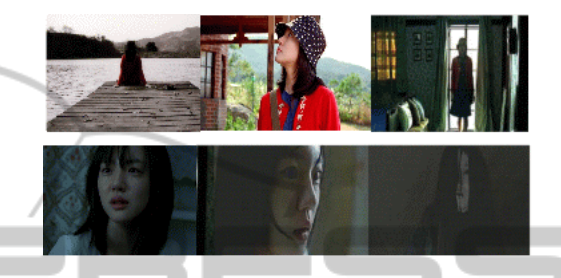
Figure 1: The example of the experimental stimulus. (above: neutral, below: fear)

pictures (Palomba, Sarlo, Angrilli, Mini and Stegagno, 2000). Parts of a Korean horror movie, 'A Tale of Two Sisters (2003)' were selected as stimuli. The stimulus consists of two parts, one part with 60 second-long neutral condition and the other 60 second-long fear condition as shown in the Fig 1. It has been revealed that it has effectiveness of 5.5 on 7-point Likert scale (1 being least effective and 7 being most effective) and appropriateness of 100% by preliminary experiment.