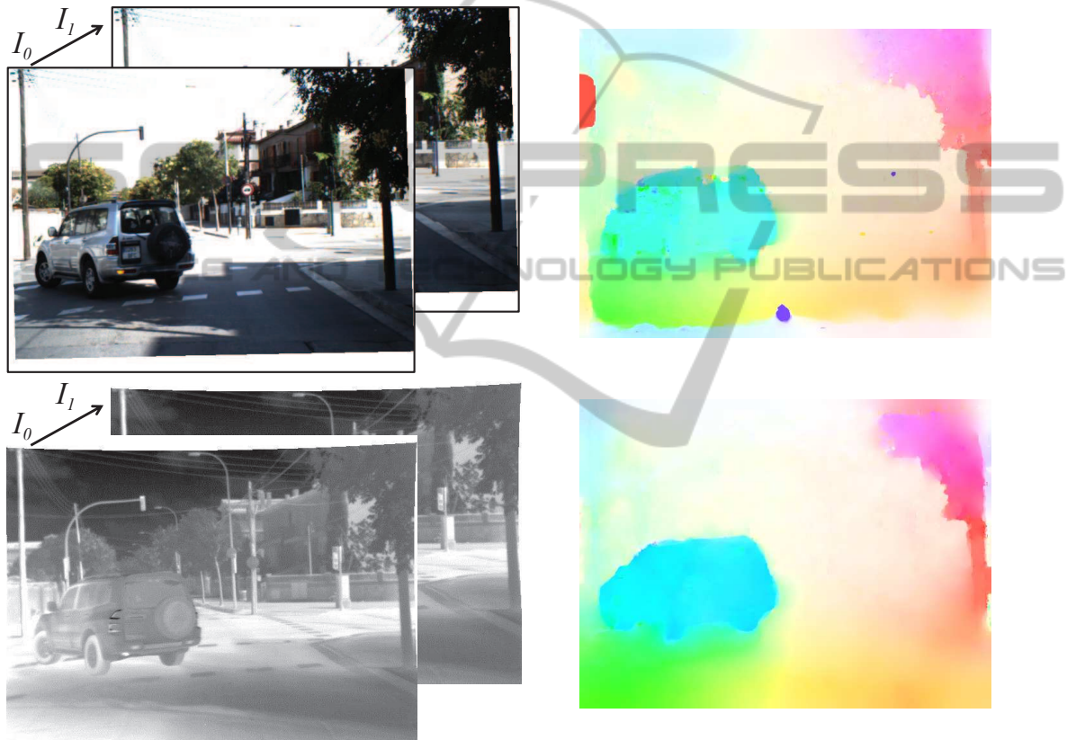
Figure 2: (left) Two pairs of cross-spectral images (VS and LWIR). (right) Dense flow fields used for the correspondence search.

similar result. Another problem to be considered for future work is the lack of ground truth disparity value, although we expect to use the Bumblebee camera (at the left side in our stereo rig, see Fig. 1) temporal synchronization problems need to be solved first (Bumblebee work up to 15fps).